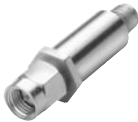
CASE STYLE: FF704